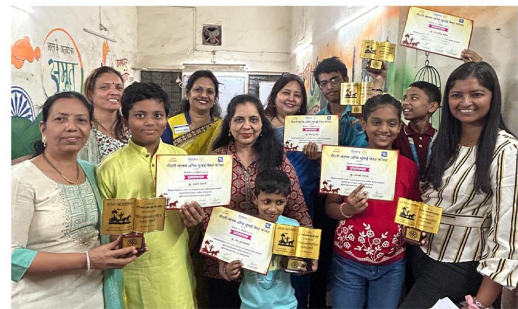
Proud moments! Congratulations to all the winners and participants for celebrating our rich heritage!