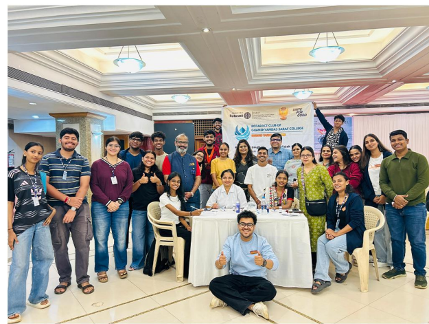
Screen, Support, Smile – A successful Eye & Hemoglobin Check-Up Camp for students