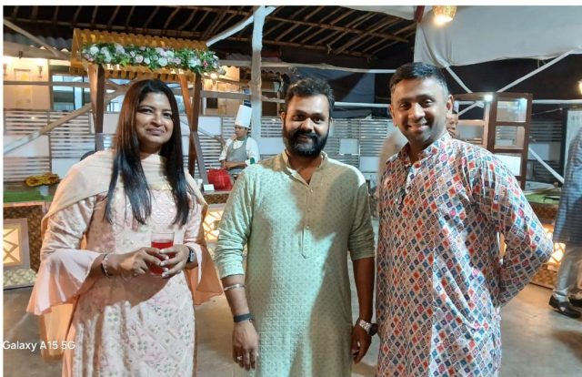
Smiles, sparkle, and togetherness — our Rotary family celebrating Diwali in true festive spirit