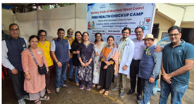
Amazing work by West coasters! Thank you all for your timely support.